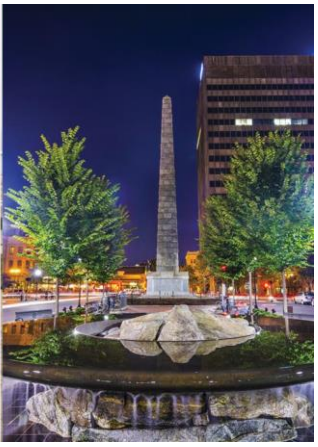
9 Days • 12 Meals: 8 Breakfasts, 1 Lunch, 3 Dinners